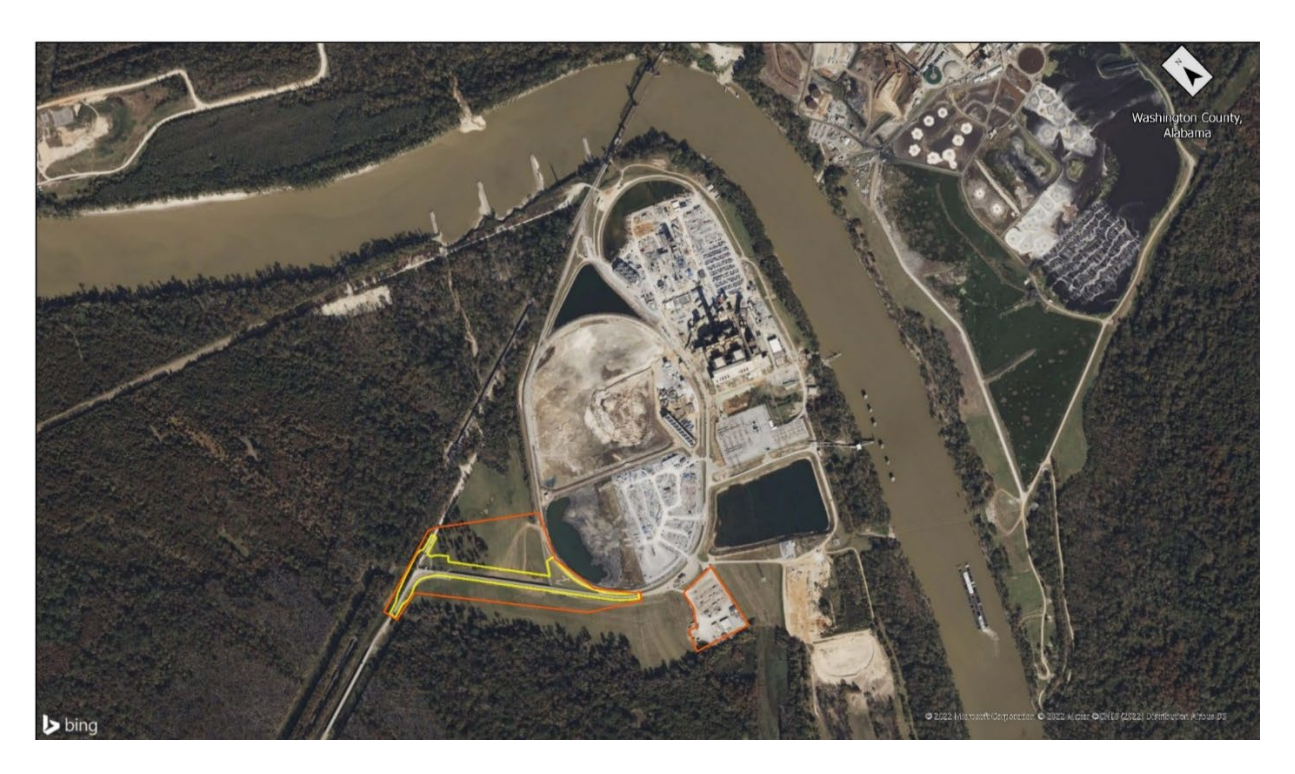
Figure 1-1 Aerial view of the LEC bridge replacement Project area, showing the proposed bridge corridor (in yellow) and potential environmental impact area (in red), including laydown areas.

realignment will tie back into the existing access road to the LEC. Once the new bridge is opened to plant traffic, the existing bridge will be removed and disposed of according to state and federal regulations. The construction of the proposed Project is estimated to take approximately two years to completion. Additionally, PowerSouth will prepare a Construction Best Management Practices Plan (CBMPP) that will describe the best management practices (BMPs) that will be utilized throughout the construction and demolition processes. Project maps are available in Appendix A.