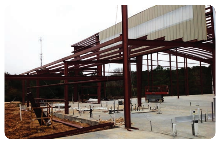
The food distribution facility under construction in Thomasville, GA. The 65,000-square-foot building will include a dry warehouse, a cooler/freezer and cold dock space, a kids' café and kitchen, administrative space, an indoor/outdoor marketplace, and a multi-purpose room for use by community organizations.

This project will significantly help South Georgia communities that need food assistance. This facility is another example of how financing from Rural Development's Community Facilities program helps provide rural residents with essential goods and services.