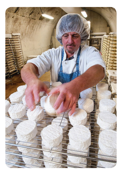
The Cellars at Jasper Hill, a cheese-maker in rural Greensboro, VT, expanded its facility, grew its business, and reached new markets thanks to a Business and Industry Guaranteed Loan.

The Rural Business-Cooperative Service provided major support for local and regional food systems in FY 2014. Using a combination of grants, guaranteed loans, and direct loans, RBS awarded nearly $77.5 million for 231 projects to develop or expand local and regional food businesses.