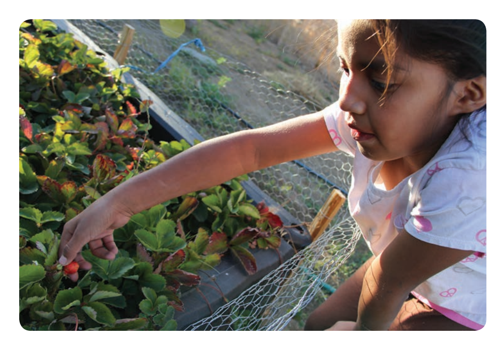
The Walker River Paiute Tribe in Schurz, NV, is using hoop houses to grow fruits and vegetables for the community. Children learn about planting and growing in the hoop house gardens. The produce is donated to tribal elders at the senior center and used at the youth center.