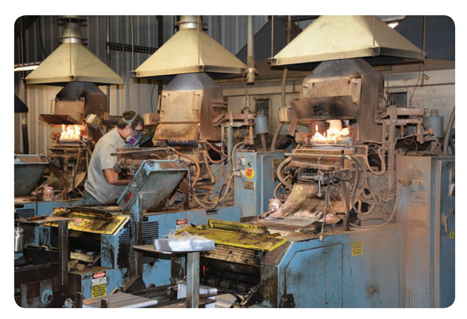
Superior Battery used USDA support to make its manufacturing process more efficient and hire new workers at its battery manufacturing plant in Russell Springs, KY.

In FY 2014, USDA Rural Development created, saved, or retained more than 3,500 jobs in StrikeForce areas. For instance, the agency provided Superior Battery, a locally owned and operated manufacturer located in Russell Springs, KY, with a $10 million Business and Industry program loan guarantee in partnership with local lender Community Trust Bank. Superior Battery is using the funds to make its manufacturing processes more efficient to ensure that the