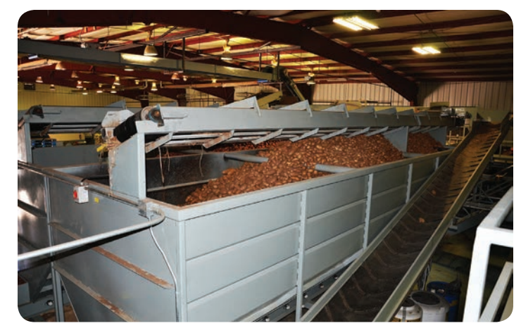
Organic potatoes being processed by White Rock Specialties, LLC in Mosca, CO.

The Mosca community welcomed White Rock with open arms. During the first year of operations, the facility was so busy managers had to turn down contracts because the plant was already at capacity. The company hired 15 workers to increase production. By 2014, though, in just a year, White Rock was