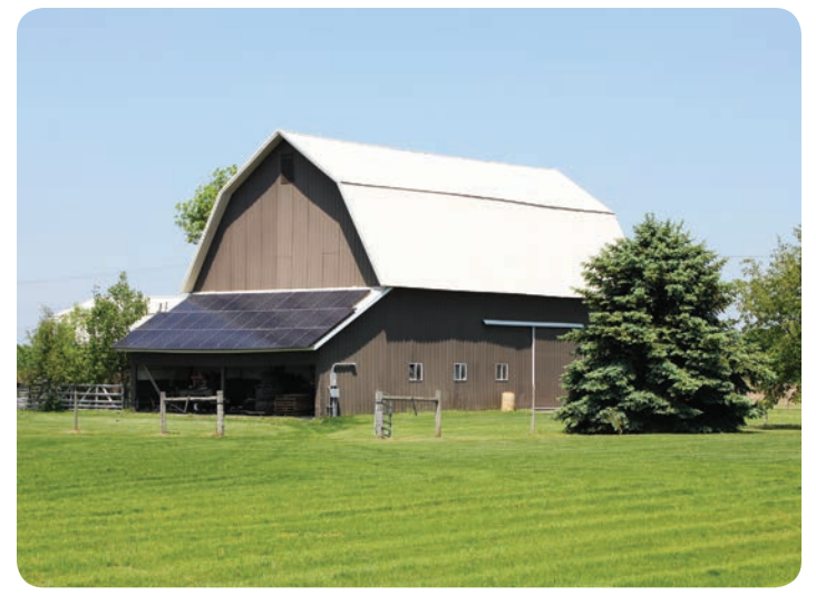
Headsight, Inc., in Bremen, IN, is using a USDA Rural Energy for America Program grant to install a solar panel system that will reduce its energy costs.

USDA Rural Development gave Headsight a $19,800 Rural Energy for America Program (REAP) grant for a photovoltaic solar panel array. Through the REAP program, USDA provides loans and grants to agricultural producers and rural small businesses to