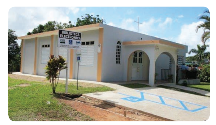
Three very small rural communities in Puerto Rico used a grant from USDA to buy computer equipment and start an electronic library for local residents.

Community leaders used an existing building for the library and contributed about $8,400 to convert the space and make other improvements.