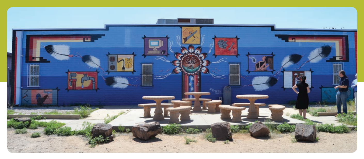
USDA provided a $145,300 Native American Community Facilities grant to the Tohono O'odham Community College in Arizona to construct a new 1,800-square-foot building.