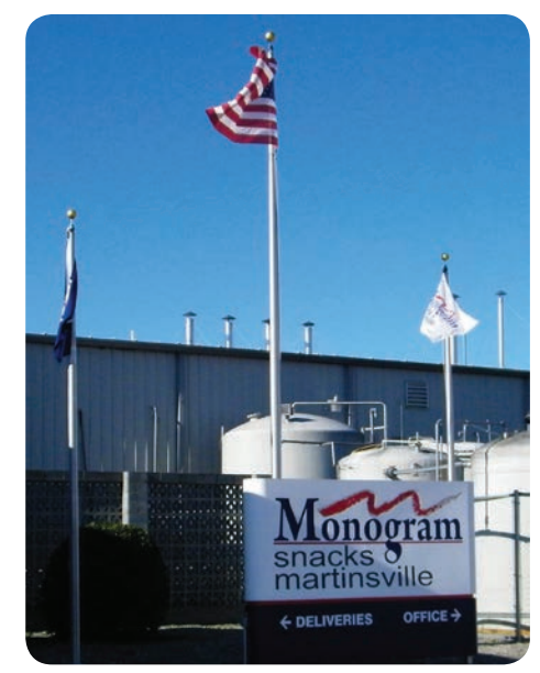
The Monogram Foods plant in Martinsville, VA, has brought more than 500 jobs to the area.

With USDA's help, this food-maker is providing critically needed jobs for residents in the Martinsville area, improving the local outlook for a small community in one of the most economically depressed parts of the State. Since opening, the Martinsville plant has been so successful that Monogram Foods added a third shift in 2014, bringing the total workforce up to more than 500 employees.