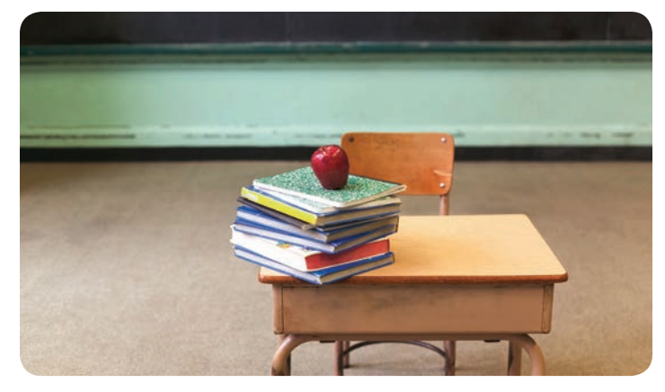
Rural Development's Community Facilities program helped the Quest Montessori School build more classrooms.

USDA Rural Development provided a second, $900,000 Community Facilities Ioan in 2014 to help Quest Montessori expand again.