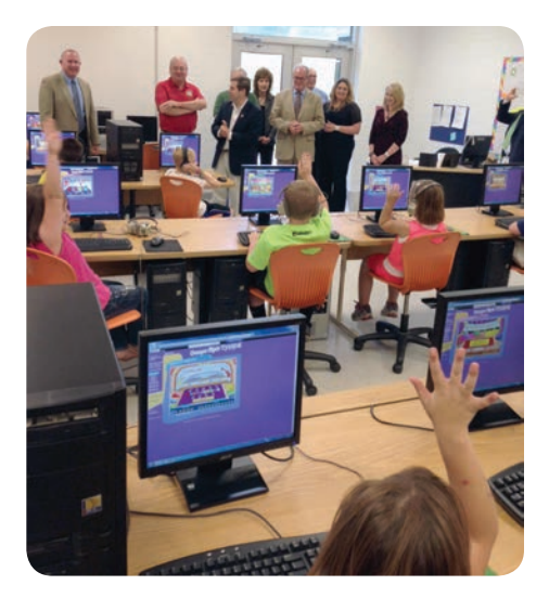
Grade-schoolers at Winfield Elementary in Scott County, TN, participate in a class discussion at their computer lab. The lab was improved thanks to help from USDA for equipment and software.

USDA's $118,000 investment is another example of the agency's work to help rural communities. The part of east Tennessee where the schools are located is targeted for special aid through a USDA initiative to direct resources to the neediest areas. The StrikeForce for Rural Growth and Opportunity Initiative is underway in 19 other States. USDA's StrikeForce Initiative helps grow rural economies, increases investments, and creates opportunities by providing additional hands-on and technical assistance from local USDA field staff.