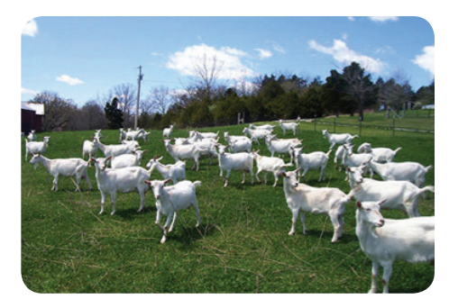
Part of the Baetje Farms goat herd. This family dairy farm and creamery is thriving thanks to USDA grant assistance that helped the owners find new markets for their goat cheese and launch a Website for online sales.

Today, thanks to the grant from USDA, Baetje artisanal cheeses are sold in about 25 restaurants and wineries in Sainte Genevieve County and the St. Louis region. They are