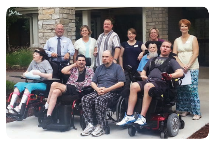
Patients and staff at Winning Wheels. The expansion is boosting Prophetstown's economy through construction and lending activity and new jobs at the short-term care facility.

Winning Wheels is a traumatic brain injury rehabilitation center in Prophetstown, IL, that attracts clients from across the United States. It is one of very few facilities offering rehab services and skilled nursing care. Most patients are permanent residents, but the center's administrators wanted to start a short-term care program for clients who would return home after treatment.