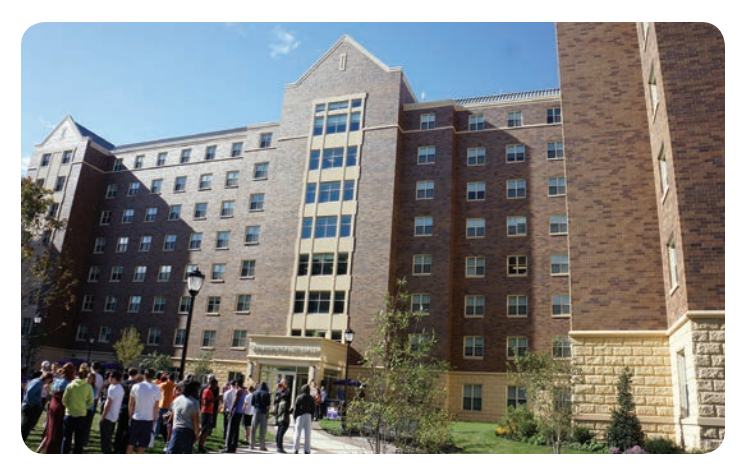
West Chester University's new student dormitory, which was built thanks to loan financing from USDA Rural Development.

The new, modern dormitory includes Internet and cable access in each room, generous study and recreation space, well-