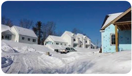
Twelve new apartments at Sharon Ridge Apartments were built through a financing partnership between USDA and the State of Connecticut.

In addition to loan financing for construction, USDA is also providing ongoing rental assistance to ensure the low-income families living in the complex are able to afford their monthly rent.