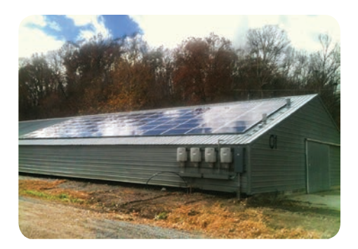
A solar panel array on top of one of Malcolm Farms' poultry houses. The renewable energy system is helping this rural West Virginia farm operation save money on its energy costs.

After the panels were installed, Malcolm Farms presented information about this project during a seminar at the Eastern West Virginia Community and Technical College in Moorefield. The seminar led to increased interest in solar power for poultry farms in the region.