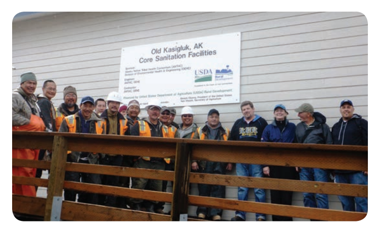
The Kasigluk waste treatment plant's local work crew is with USDA officials.

Before the upgrades, village residents had been hauling water from a well, and were using "honey buckets" to dispose of waste, carrying them from home to a common collection site. These RAVG grants are crucial to help alleviate the dire sanitation conditions that exist in these extremely remote, rural villages.