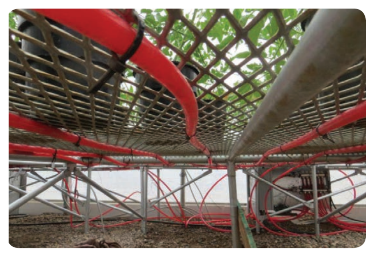
New under-bench hot water heating for the greenhouse was funded by a grant from USDA Rural Development.

The Alliance food bank program distributes food to nearly 2,000 customers and delivers vegetables grown on its farm to local