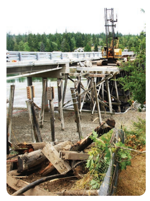
Construction of the new, improved bridge for Raft Islanders in Washington State.

Washington Rural Development FY 2009-FY 2014 Yearly Totals