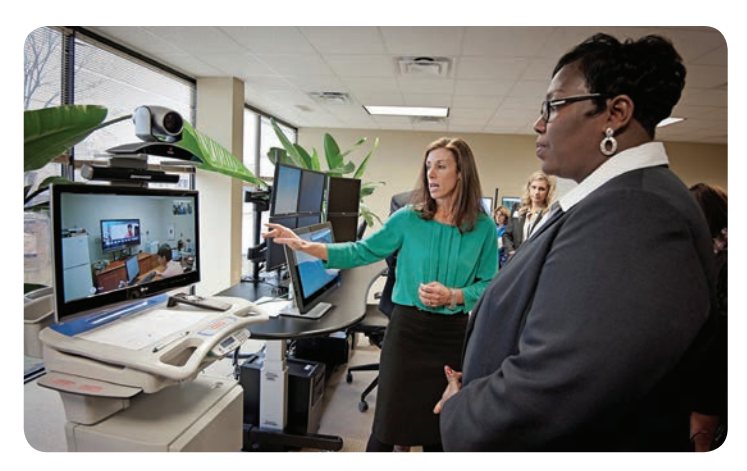
University of Mississippi Medical Center staff members give a demonstration of the new telemedicine system.

A delay in medical care due to lengthy travel can be the difference between life and death. Thanks to the grant from USDA, the telemedicine program will provide rural Mississippi