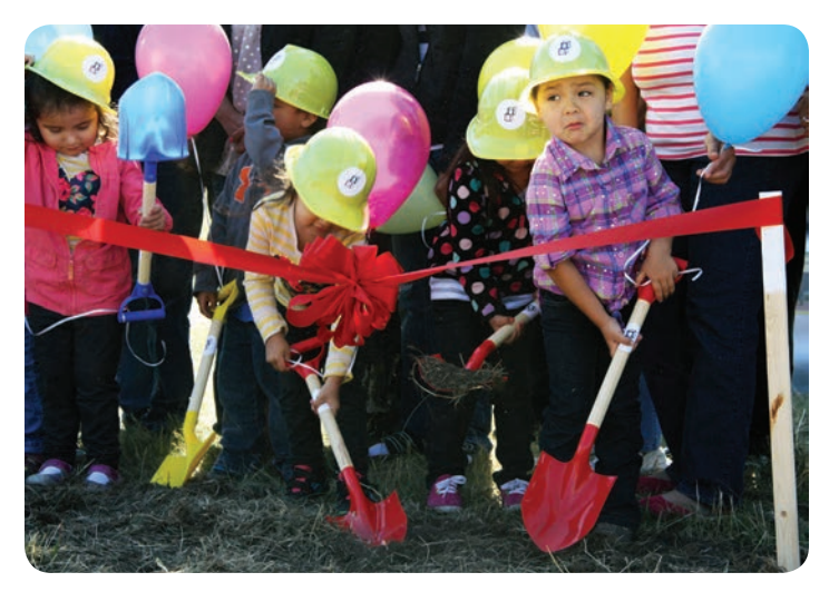
Children help break ground for a facility that will improve Head Start earlychildhood education opportunities for the Spirit Lake Tribe.

The new building will consolidate all of the Spirit Lake Tribe's Head Start classes under one roof and will accommodate up to