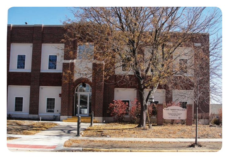
At East Ward Village Apartments, an old school building was converted into 15 new, modern apartments. Six duplexes were also built on the grounds.

The former grade school was converted into 15 apartments and 6 new duplexes were built onsite. Builders incorporated energy efficiency into the design to help residents save money on their energy costs. The duplexes have geothermal heating and cooling