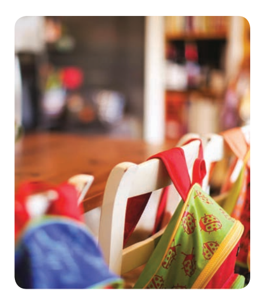
USDA helped finance construction of a new school building that will increase educational opportunities for rural Polk County, FL, middle-schoolers.

USDA Rural Development partnered with the 1st Manatee Bank in Bradenton, FL, to provide a $3 million Community Facilities Guaranteed Loan to fund an expansion of the school. Berkley Accelerated is using the loan to construct a two-story school building with nine classrooms, two computer labs, a science lab, restrooms, storage space, and a covered outdoor area for gatherings/events. The expanded facilities will allow the school to serve up to 600 students during the school year.