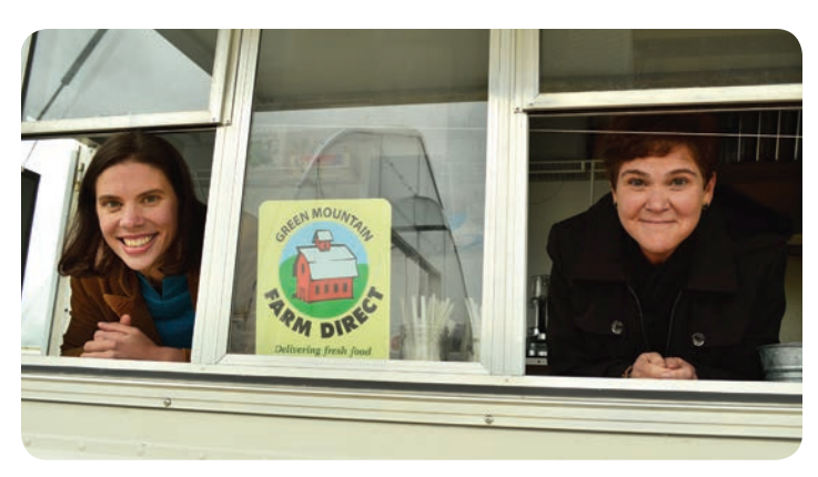
Agriculture Deputy Secretary Krysta Harden (right) on Green Mountain's "Lunchbox" truck to provide healthy lunches to Vermont children over the summer.

Green Mountain also participates in USDA's summer feeding program, through its "Lunchbox" truck to feed hungry kids. When schools let out for the summer and meal service ends, Green Mountain picks up the slack, benefitting both nutritionally