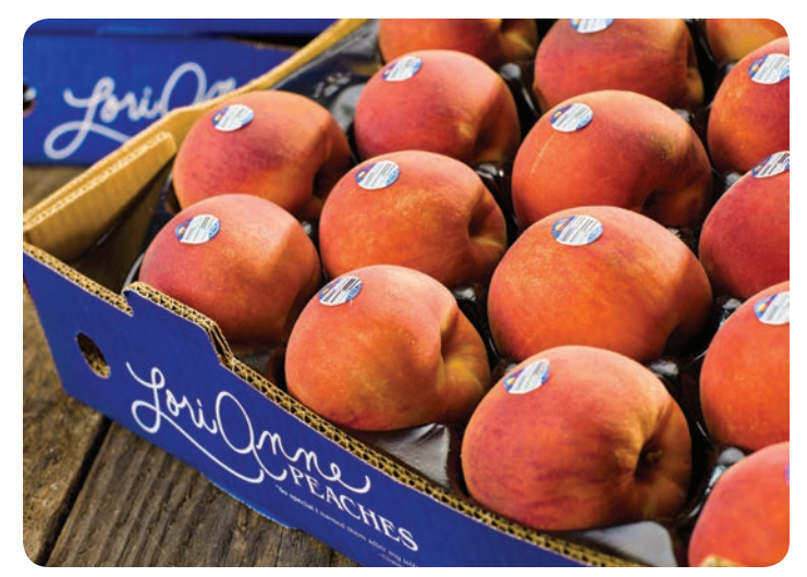
Titan Peach Farms received a $75,000 Value Added Producer Grant to determine the feasibility of producing several value-added products from its peaches.

Rural Development's Value-Added Producer Grant Program helps agricultural producers increase their on-farm income by