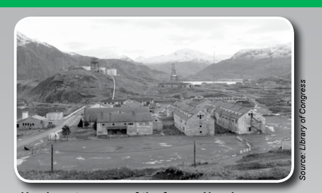
Headquarters area of the former Naval Operating Base at Dutch Harbor, Unalaska Island, Alaska