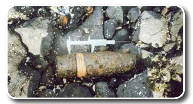
An example of a medium caliber munition

Because explosive hazards associated with military munitions from past military activities may remain on and in the surrounding waters of Range Complex No. 1, the U.S. Army Corps of Engineers recommends that landowners and visitors follow the 3Rs of Explosives Safety – Recognize, Retreat and Report.